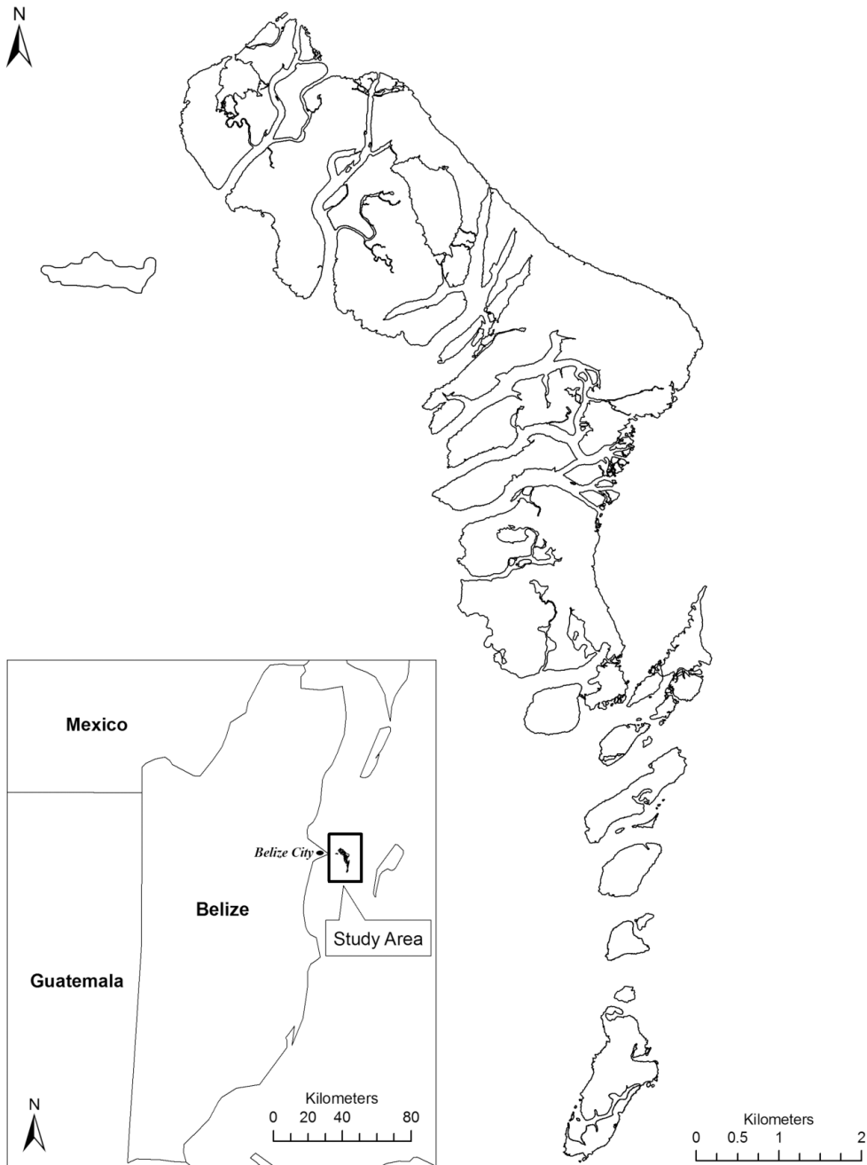
Figure 1. Map of Belize (inset) and the Drowned Cayes in relation to Belize City

a General Oceanics mechanical flowmeter model 2030R from Forestry Suppliers; speed range 10 cm/s to 7.9 m/s) were measured at three points in the water column—surface, mid-water, and bottom—above each resting hole. Latitude and